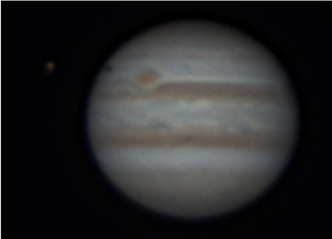
Jupiter imaged on 21-11-24. The moon Europa is to the left, with its shadow beginning to transit the planet.

The newsletter of Orwell Astronomical Society (Ipswich)